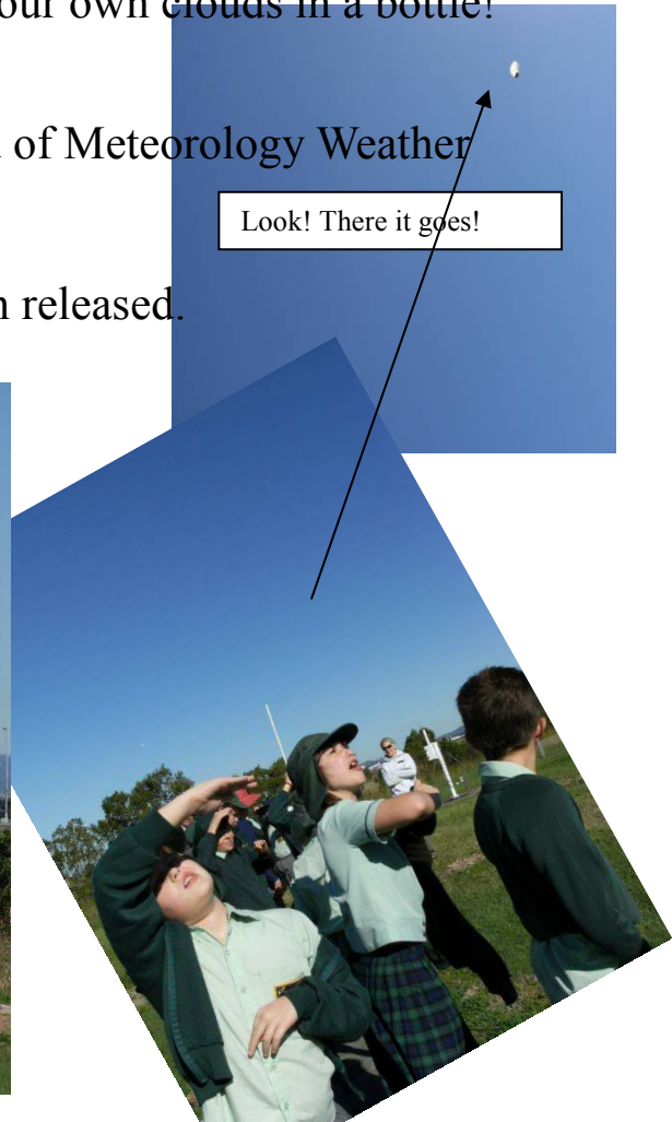
Look! There it goes!