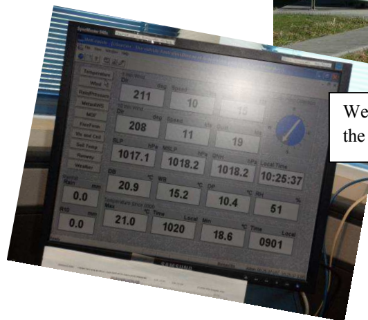
We were shown the data gathered from the weather balloon.