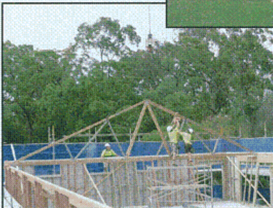
And in next to no time all the trusses are in place.