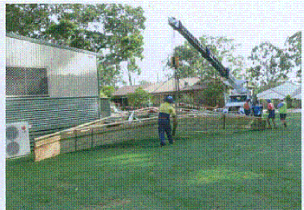
Gently does it. Mind our lovely turf!