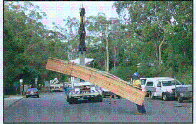
The crane picks up all the trusses and sets off down the street ...