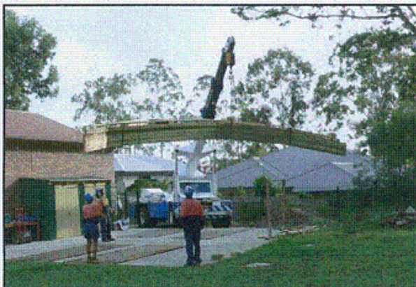
... or any of the neighbours!