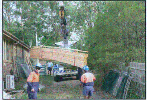
And don't damage Senior School ...