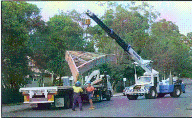
The semitrailer with the trusses cannot get any closer to the site than the street. Help arrives.