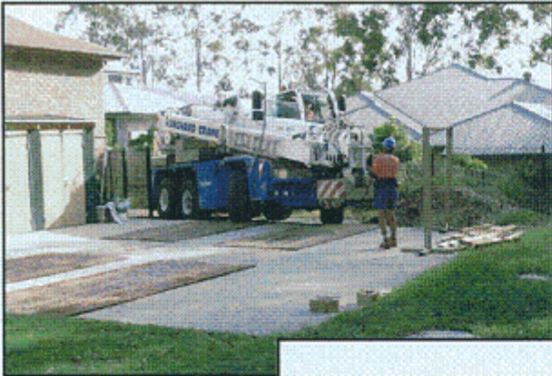
What's this coming?